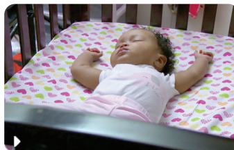
Safe Sleep at Home