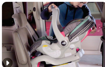
Infant Car Seat