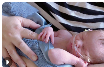
Touch & Soothing Techniques